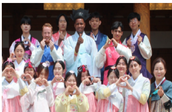
Trying on a Hanbok