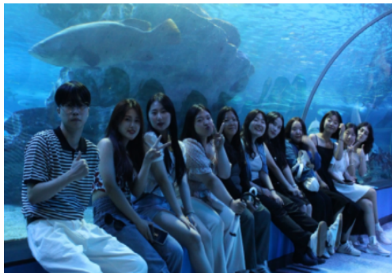
At an Aquarium